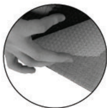
3-stage washable media

All filters restrict air flow. The degree of restriction is measured as "pressure drop" and will determine how long and how hard a fan motor will need to operate to achieve the desired heating or cooling level in your home. Therefore selecting a low pressure drop filter will significantly reduce annual electrical, heating and cooling costs. Reduce your pressure drop with our model Airtscreen 500.